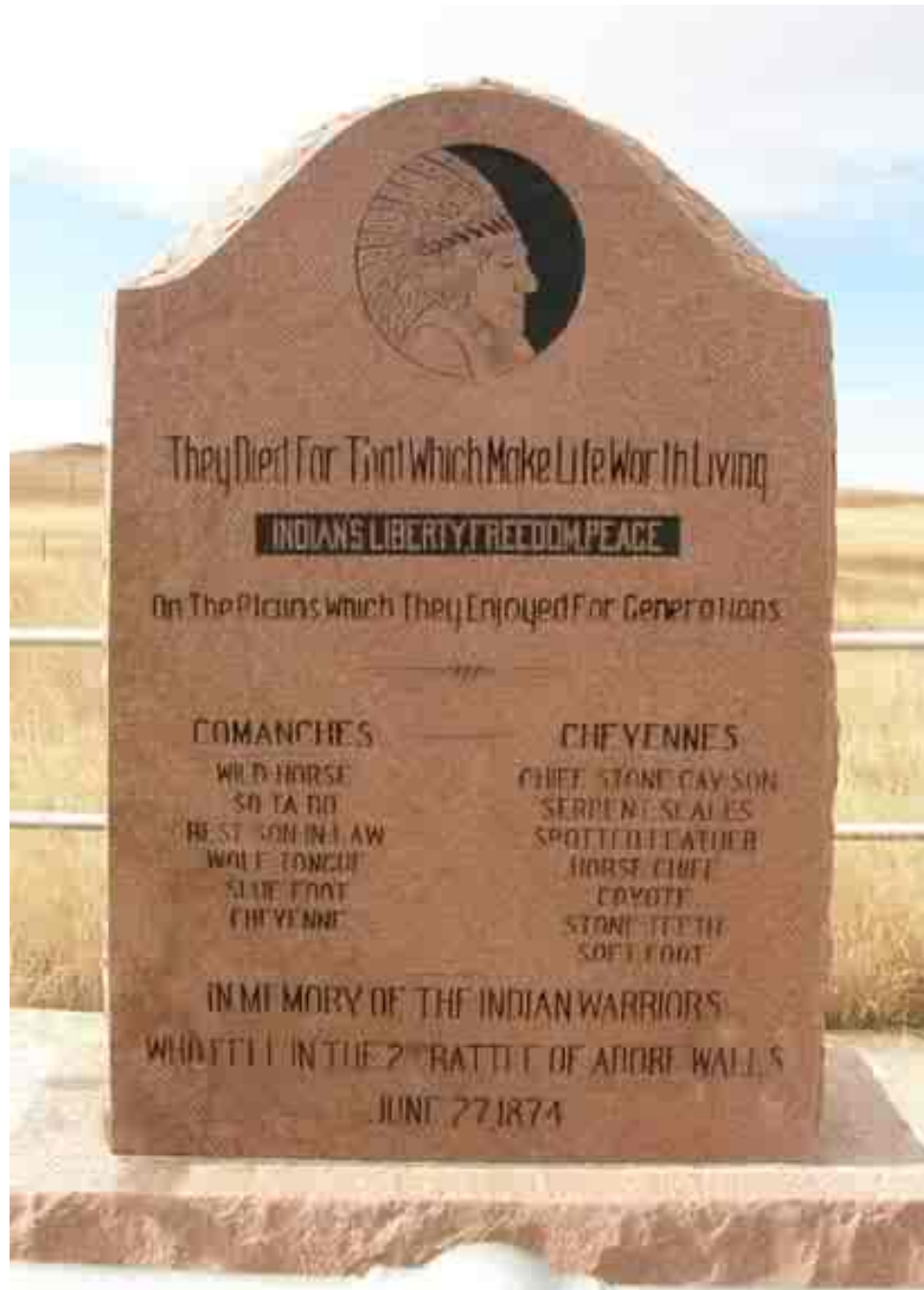
A close up of the Comanche and Cheyenne Marker. Photograph by Barclay Gibson, December, 2008, in Adobe Walls, TX. http://www.texasescapes.com/TexasPanhanceTowns/Adobe-Walls-Texas.htm#battle (accessed 26 June 2010).